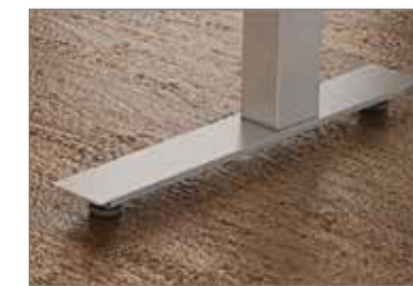
Euro-inspired flat low profile foot creates a sleek modern aesthetic.