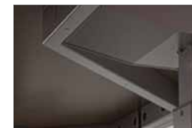
Hidden frame elements provide unmatched support with keyboard arm compatibility, and the frame is width adjustable so one base fits tops from 48" to 72".