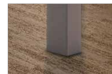
Three-leg tables feature a foot-free center leg to enhance design symmetry.