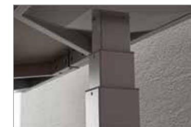
Three-stage legs smoothly and silently to adjust the work surface height from 22" to 48".