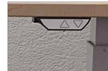
Standard up/down switch moves the work surface with push button ease.