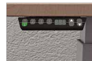
Optional digital read out memory switch allows up to four user-programmable height settings.